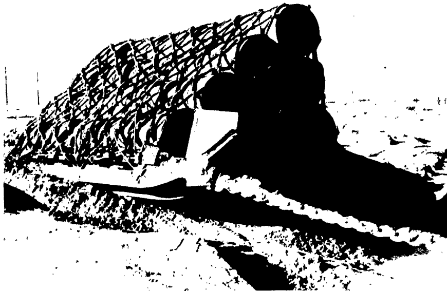
Figure 5. Toboggan being pulled over the edge of a berm in sandy soil. The toboggan did not distort, and the load did not shift.