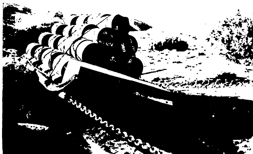
Figure 2. Toboggan being subjected to racking action at Rose Valley Test Site on hard, uneven terrain, the load secured by chains and chain binders.