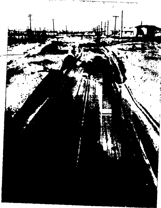
Figure 3. Uneven soft sand terrain leveled by the weight of the towed toboggan.