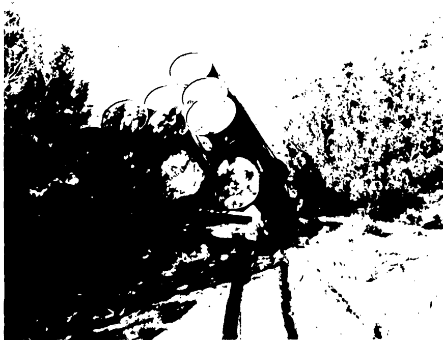
Figure 6. Shifting of load secured with chain rigging during trail tests at Rose Valley.