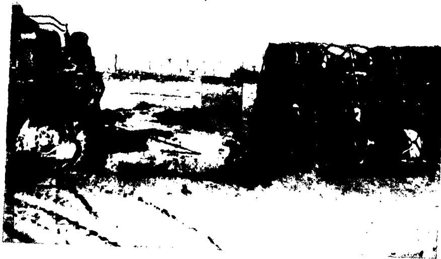
Figure 4. Toboggan being pulled backward in soft sand.