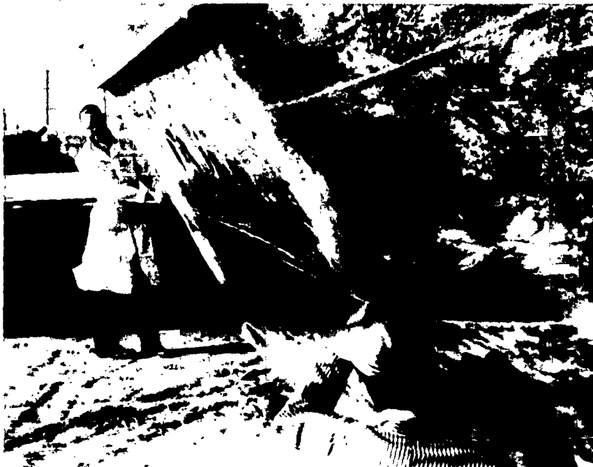
Figure 8. Measurement of 1-3/4 in. bow in the bottom plate of the toboggan at completion of trail tests.