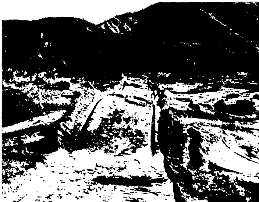
Figure 7. Toboggan tracks in hard, uneven terrain at Rose Valley Test Site.