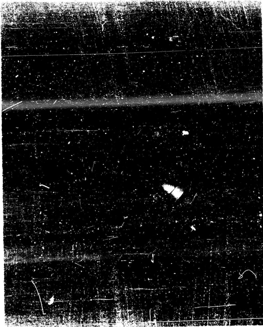
Fig. 1. Electron gun for the experimental medical accelerator.