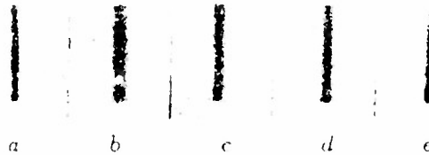
Fig. 1. X-ray photographs (photographic enlargement 1.5). a, direct beam without sample; b, sample of rolled copper, axis of rolling parallel to slit; c, axis of rolling perpendicular to slit; d, annealed sample of rolled copper, axis of rolling parallel to slit; e, axis perpendicular to slit.

(2) We studied samples of pure electrolytic copper rolled into sheets 0.11 mm thick, some not annealed, others annealed in vacuo at 800 degrees for 4 hours; samples of very pure cast aluminum (99.99 percent) 1.5 mm thick; similar samples of cold-worked aluminum; and samples of aluminum of commercial purity, prepared by sintering.