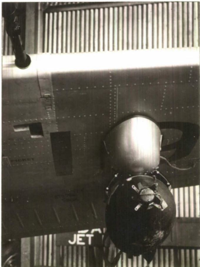
FIG2. 250 LB. GP MK.4. BOMB. FRONT VIEW.