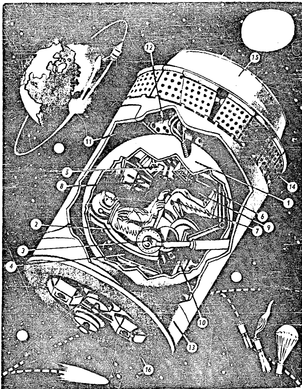
Fig. 3. First Man in Space. A Simplified Drawing of a Space Capsule Weighing 4725 kg