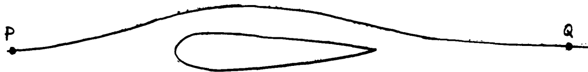
Fig. 2 The geometrical configuration of the points P & Q