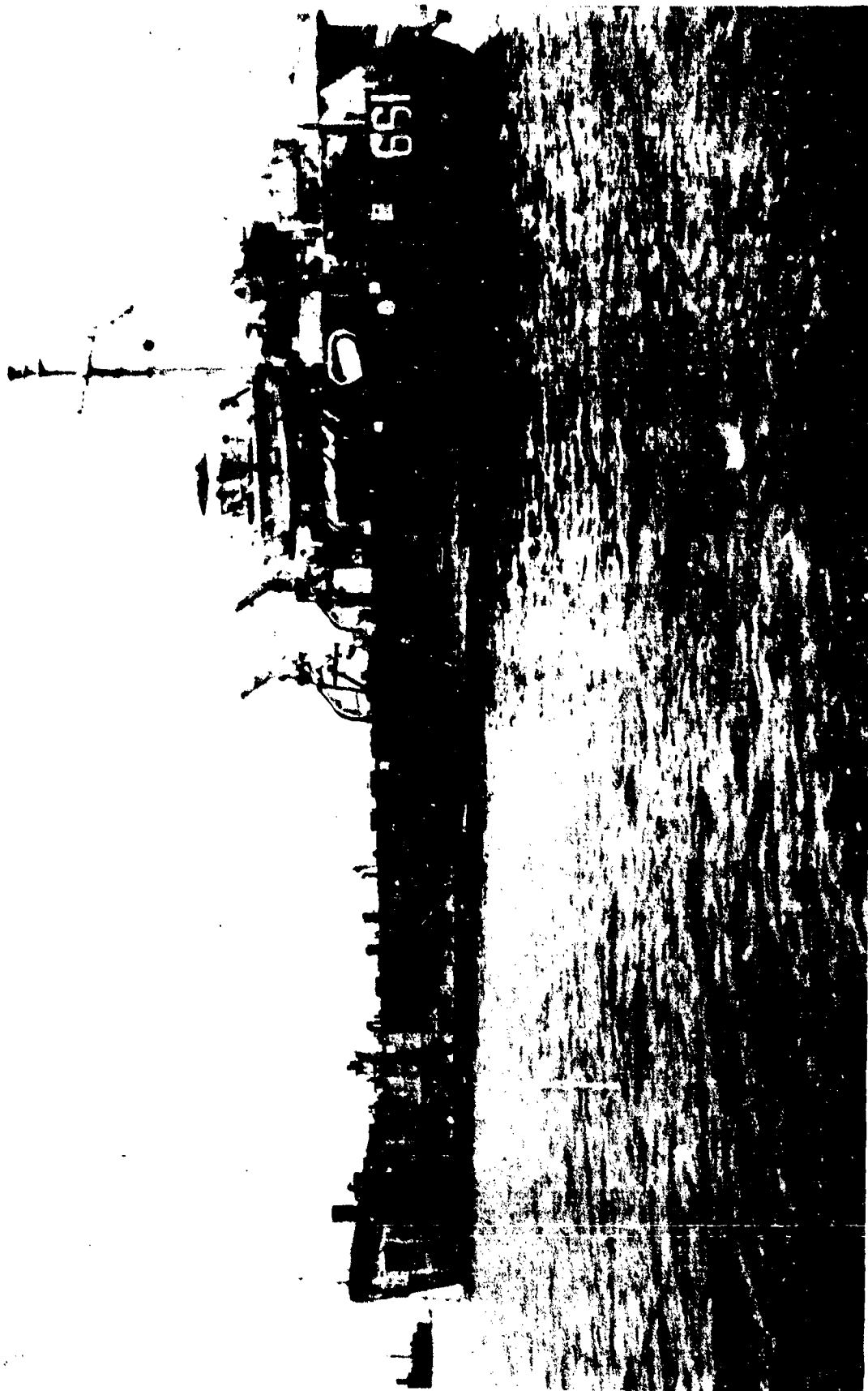
AB-CR-227-289-145. View from off port quarter after Test B.