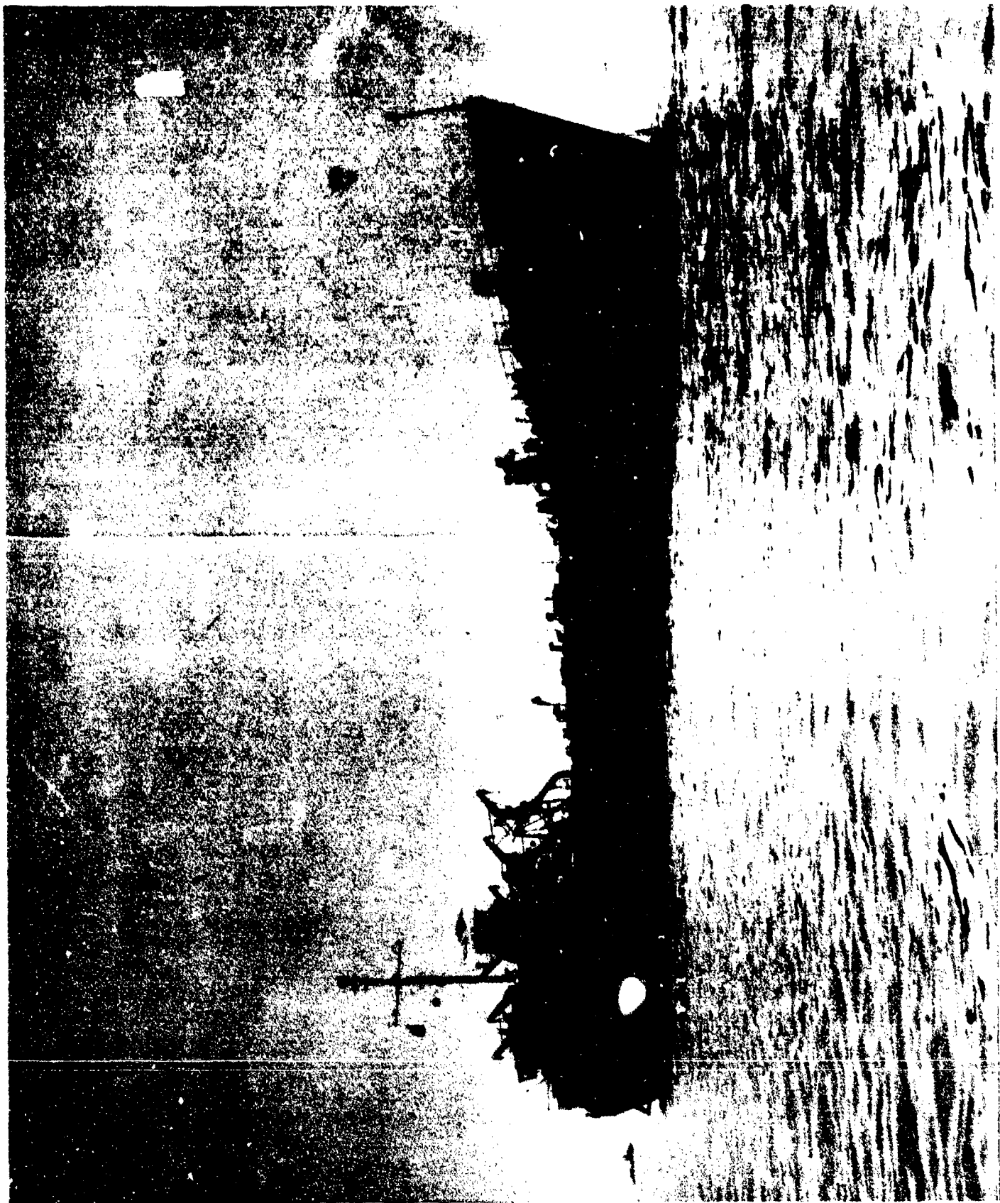
AB-CR-227-289-141. View from off starboard bow after Test B.