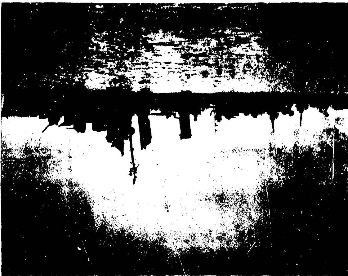
AB-CR-2271-283-86. View from off starboard beam after Test B.