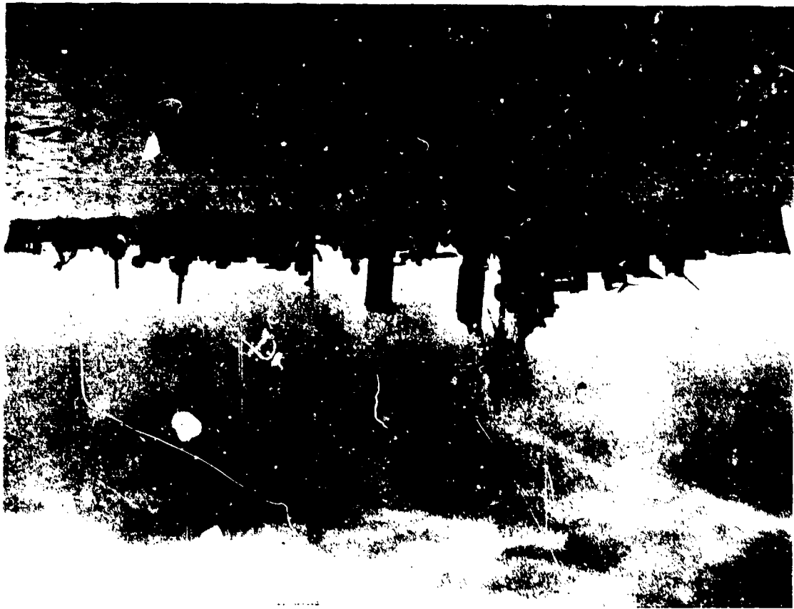
AB-CR-227-283-82. View from off port beam after Test F.