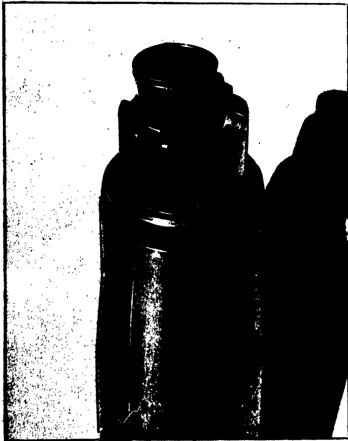
Photograph 3 -

Blank charge about to be inserted into adaptor.