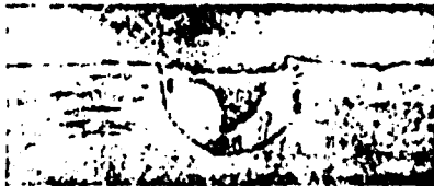
Figure 3. Microsection of an item with a corrosive pit; x 100.

The configuration of the pits inside of the metal had a very specific character: corrosion spreads practically perpendicular to the surface of the metal with a smooth rounding at the bottom (Figure 3). No sub-surface cavities were discovered.