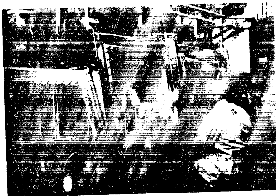
Figure 1. Exposing Monkey to Microbial Aerosol. (18064-32-AMC-65)