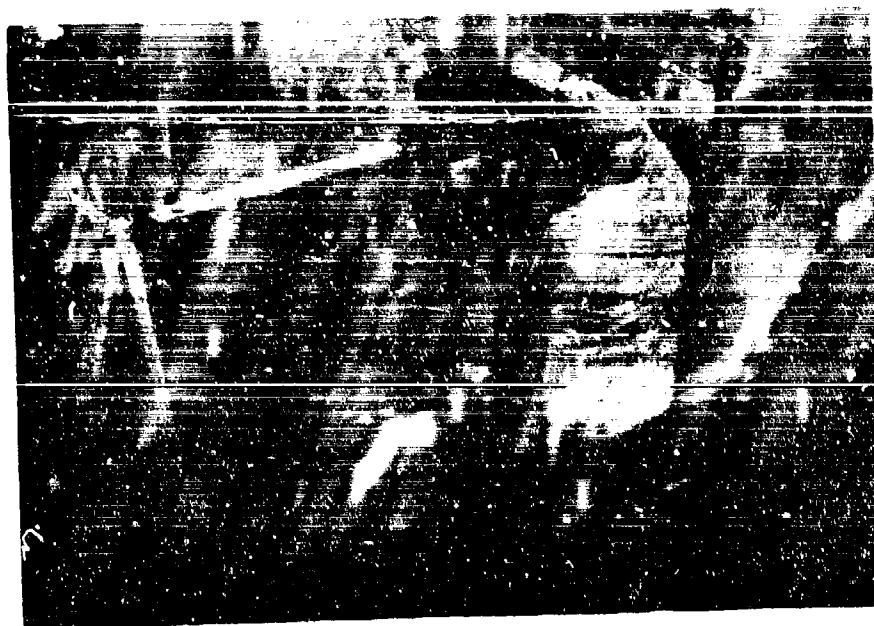
Figure 2. Air-Washing Monkey in Transfer Cabinet. (18064-34-AMC-65)