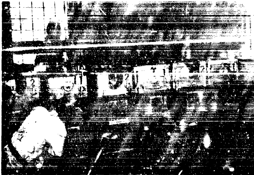
Figure 3. Ventilated Cages for Aerosol-Exposed Monkeys. (18064-35-AMC-65)

Air passed through these cages at 65 liters per minute. Airflow was from the room, through a high-efficiency filter 7 into the first cage housing the aerosol-exposed monkey and his cagemate control, then out of this cage through a short rubber air duct into and through the second cage housing the second control monkey, into a manifold that contained an ultra-high-efficiency filter, and finally to the exhaust plenum. Air samples were taken at the air sampling ports at 2, 4, 6, or 8 hours after challenge.