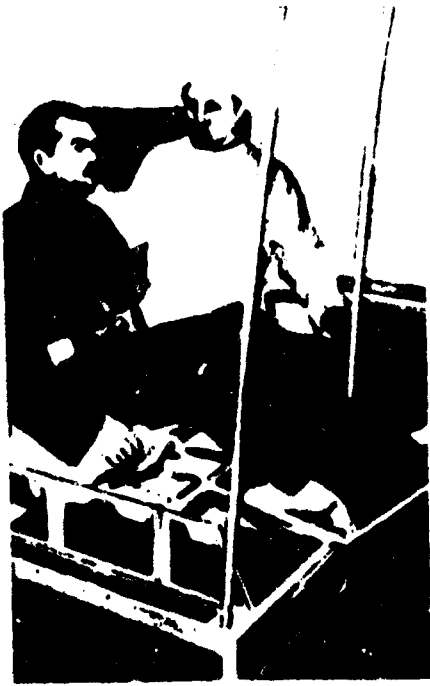
Andrian Nikolaev training his vestibular apparatus in a swing.