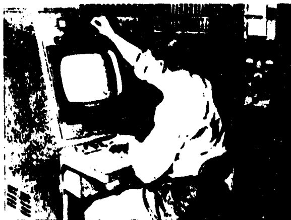
The flight of a spaceship is followed on the screen of a ground station.

Pilots, when placed in a barochamber, whether or not equipped with a compensating suit, but having been administered oxygen, adapted themselves well to conditions of low pressure by acceleration of the pulse rate and lowering the resistance encountered by the blood in traveling from the heart to the periphery of the body.