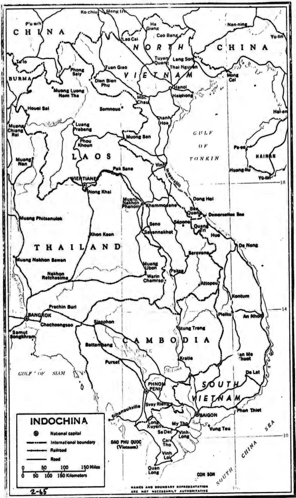
An Annotated Bibliography on the Climate of North Vietnam U. S. Weather Bureau