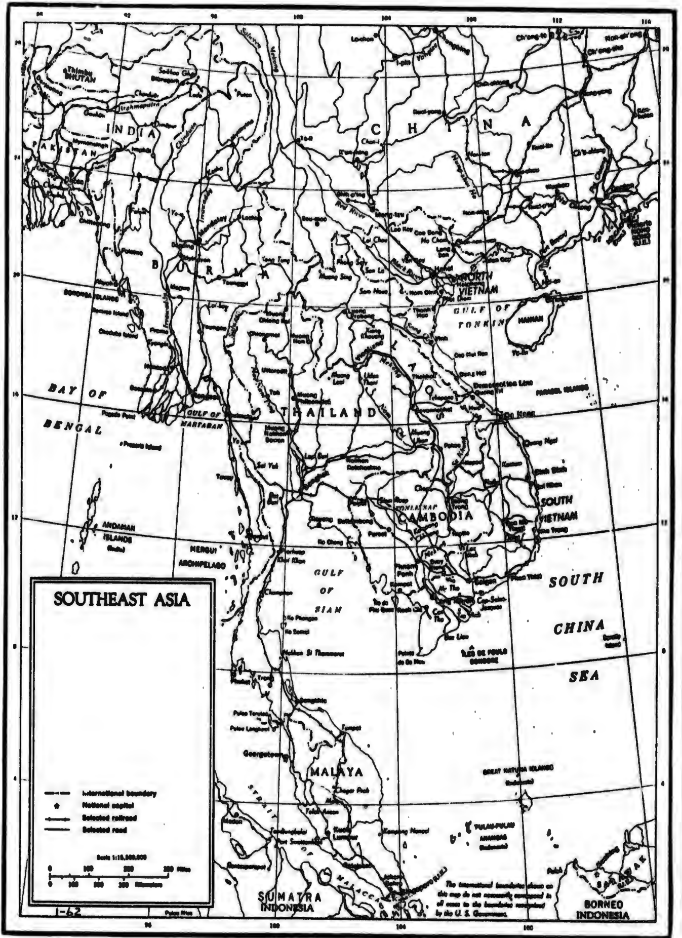
An Annotated Bibliography on the Climate of North Vietnam U. S. Weather Bureau