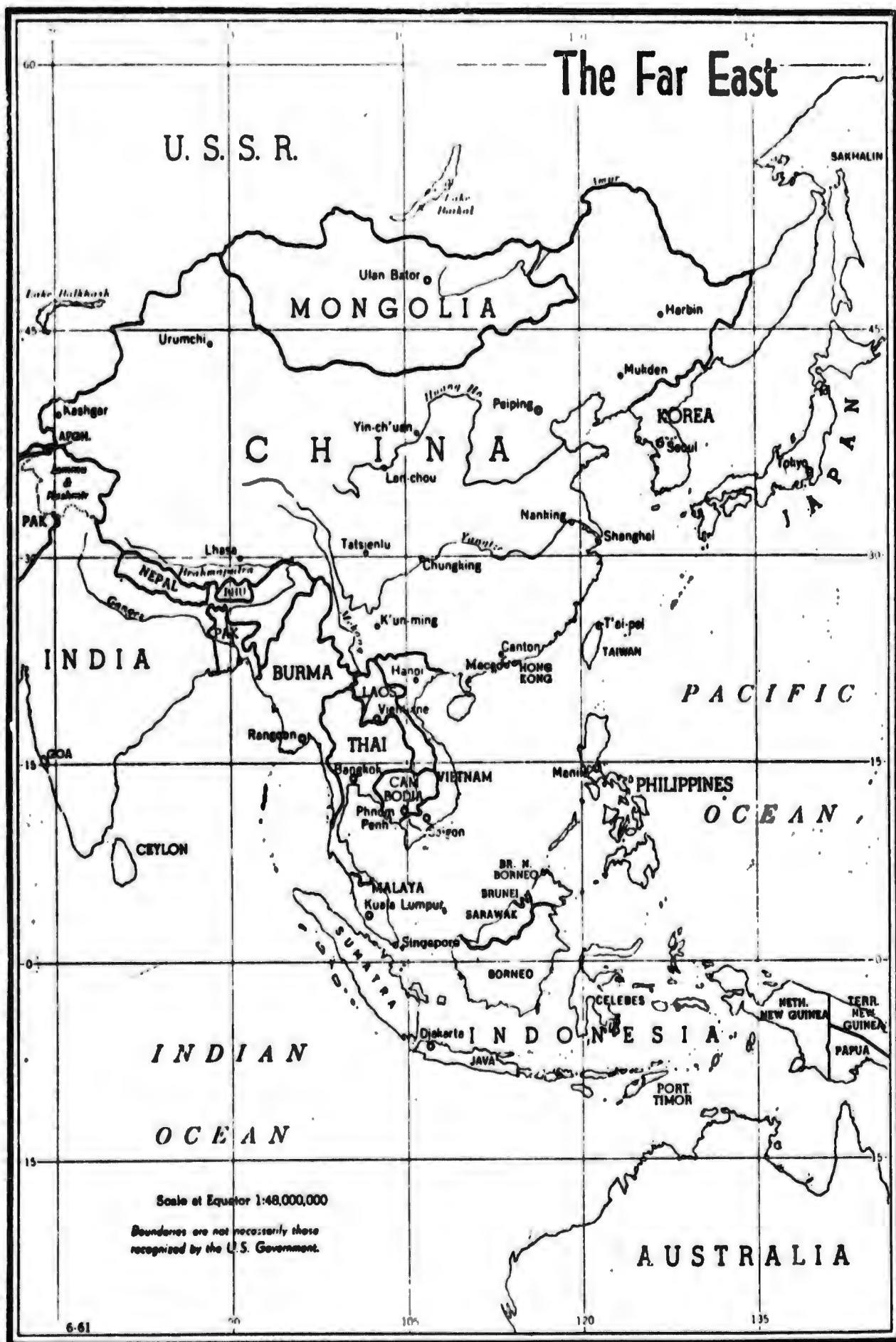
An Annotated Bibliography on the Climate of North Vietnam U. S. Weather Bureau