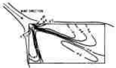
Figure 4 Plan view of roof with negative pressure distribution shown by contour lines (after Leuthesser).

Figure 2 shows a complete building (still in two-dimensional flow) in which the roof is steep enough to protrude into the flow boundary formed by the front wall alone. This causes the streamlined flow to be pushed up even further, so that pressure occurs on the windward slope. If the slope of the roof is reduced, a point will be reached at which pressure on the windward slope becomes zero; if it is reduced further, the flow boundary will at first be sucked down and will continue to flow along the slope, and a change from pressure to suction will occur. As the slope is reduced even further, high local suctions will develop near the eave, and a third vortex region, highly negative, will suddenly form, as is shown in Figure 3.