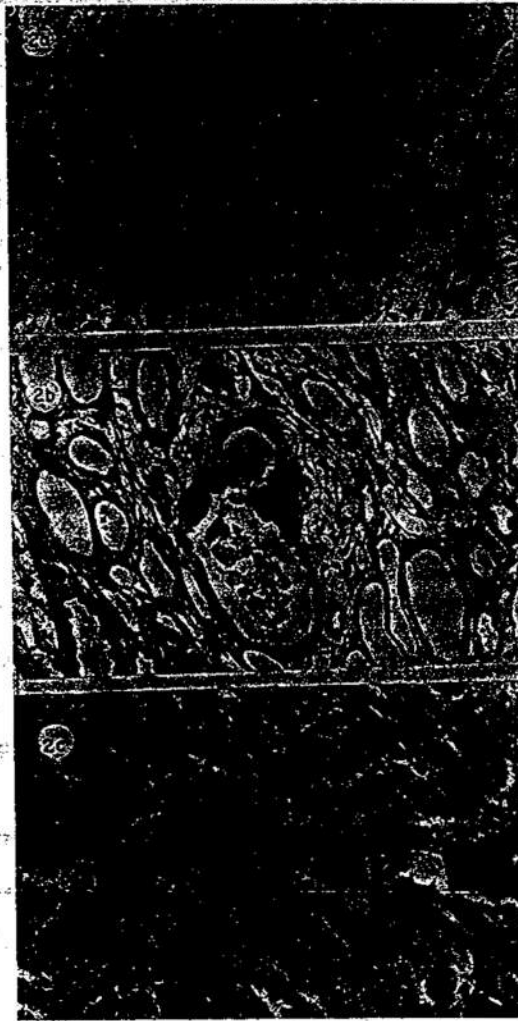
FIG. 2a. Interstitial calcium deposits in the renal medulla of a guinea pig exposed to 15% CO 2 for 7 days. 2b. Intra tubular calcium deposit in the renal cortex of a guinea pig exposed to 15% CO 2 for 73 days. 2c. Calcium deposits in tubular basement membranes of the renal cortex of a guinea pig exposed to 15% CO 2 for 47 days.

by a second significant rise during the fifth day of the exposure period when a value of 20.5 \pm 7.2 was reached. Circled values indicate daily phosphorus and calcium excretion levels which differ from control values at a 5% level of confidence and greater.