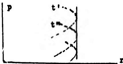
Fig.1. The solid line represents a_k(r, \alpha_k, \delta_k) = \text{const.} Each dotted line represents a_k(r, p, t, \beta_k, \delta_k) = \text{const.} at each different time, t', t'', \dots

according to (2.20) and (2.21), where (\beta_k, \delta_k) is different from one eigenfunction to another. The situation is schematically illustrated in Fig.2.