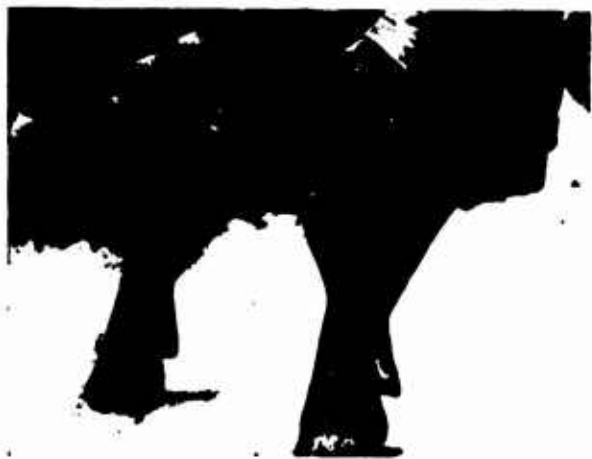
On stilts like these, some hostile spies cross our border.

In crossing the border, agents use all kinds of tricks. Some of them wipe out their tracks with special chemical preparations, to eliminate the chance of pursuit using a tracking dog. Others sweep over their tracks left in the tilled control strip. A third set changed them with mats, moving about on stilts, using grass-woven overshoes and contrivances which imitate boar, cow, and other animal tracks.