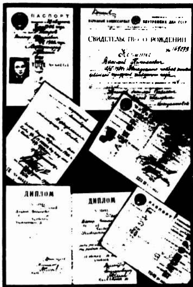
Samples of false documents discovered with foreign intelligence agents.

Instances of foreign intelligence agents being dispatched to us in the guise of refugees from capitalist countries, "seeking a better standard of living", and also persons trying to reunite with relatives residing in the USSR, are not rare. Several bourgeois intelligence services send agents disguised as fishermen. These "fishermen" sail right up to our shores on schooners and photograph ports, bays, shoreline relief, coastline structures, boats in the roadstead, etc. Japanese intelligence uses the latter method the most actively.