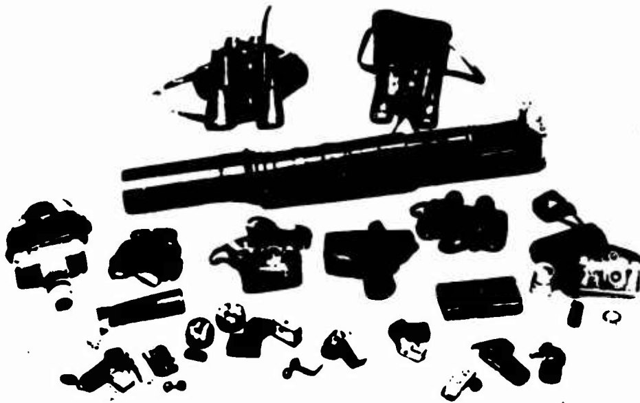
Binoculars and cameras taken away from foreign intelligence agents.

and aboard every plane and other aerial conveyance used for intelligence purposes.