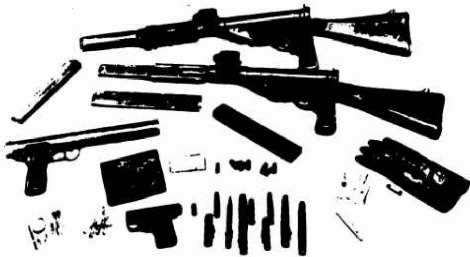
Weapons, confiscated from enemy intelligence agents.

There is information that along with infiltrating agents, imperialist intelligence and the military command are setting up special diversionary-intelligence troops and special-assignment groups. They are designated for subversive functions in the rear of socialist government troops in wartime, and also for fighting the national liberation movements in former colonies and dependent countries, arising on the path to independent development. They are being organized for the very same reason for which special espionage-diversion subdivisions were created in Hitler's army. These groups consisted of natural-born cutthroats who infiltrated into the Soviet troop rear areas by every possible route. Trampling over international law, the Hitlerites disguised themselves in the form of Soviet troops. Once in the rear-area locations of our troops, they spread panic, let out false rumors, murdered people with brass knuckles or a Finn-knife, mined the roads, struck railroad lines, etc.