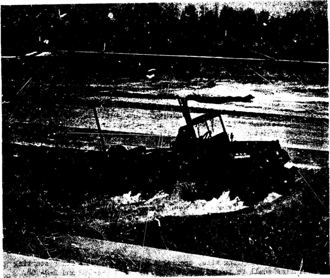
Figure 1. Quarter Ton 4 by 4 Truck Fitted with Deep Water Fording Kit Operating through Water Bath