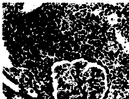
Fig. 1.—Mononuclear cellular infiltrate seen in macaque kidney autograft 1 wk after reimplantation of an organ which had previously been stored for 5 days as a xenograft in a lethally irradiated baboon.

Early attempts in our laboratory to xenobank primate hearts and kidneys were only partially successful. 19,20 Although total body lethal radiation provided adequate immunosuppression of the intermediate host, attempts to reimplant the stored organ were largely fruitless. Two explanations for this seem possible after an appraisal of these early results: a technical flaw in the procedure or an early immune response preventing adequate graft function. Benjamin has recently shown that both explanations were pertinent to the problems encountered after reimplantation. 22 Changes in technique, including the use of slightly larger macaque monkeys ( Macaca speciosa ), exceedingly careful renal dissection, as suggested by Collins et al., 23 to prevent microcirculatory collapse, and omission of the gravimetric perfusion previously used on extirpation of the donor kidney, were all carried out. In addition, because of the possibility of early postoperative morbidity and depressed renal function, contralateral nephrectomy was delayed for 7 days. With these changes, we have been able to successfully reimplant 16 macaque kidneys after a 5-day period of xenogenic storage. Once successful reimplantation was possible, we were further able to document an immune rejection process in eight of these kidneys that were reimplanted as autografts. 21 These kidneys which demonstrated excellent function while in the baboon inter-