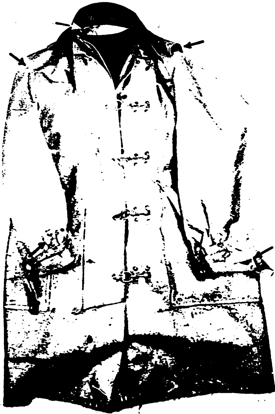
Figure 1 - Worn coat containing aluminized, neoprene-coated glass/asbestos fabric to show poor durability of basic fabric and aluminum coating