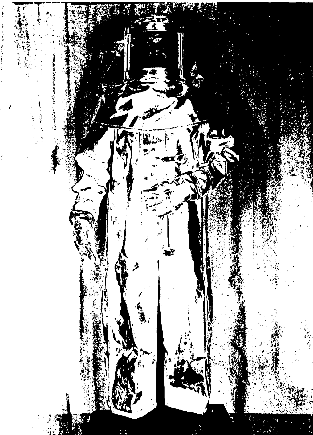
Figure 2 - Shipboard coveralls containing recommended, aluminized, neoprene-coated, 1.2-pound, asbestos fabric