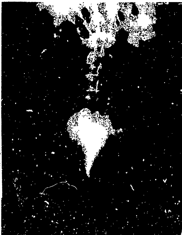
Fig. 1. Pyelogram showing dilated tortuous ureters and an elevated pear-shaped urinary bladder.