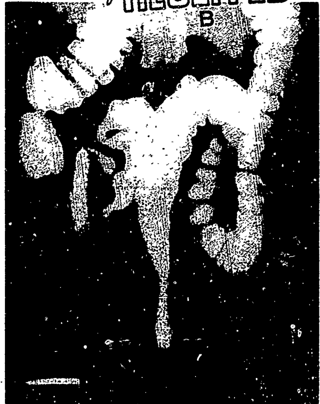
Fig. 2. Radiograph made after barium enema showing an elongated and narrowed rectum but no mucosal irregularity.

Reproduced by NATIONAL TECHNICAL INFORMATION SERVICE U.S. Department of Commerce Springfield, VA 22151