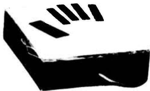
(A) ALPHA-DOT KEYBOARD