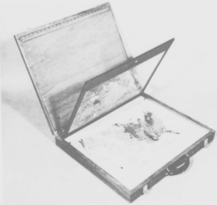
(c) Open Kit Showing Soil Map with National Forest System Overlay Map Raised