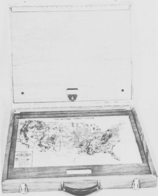
(b) Open Kit Showing Soil Map with the National Forest System Map Overlay