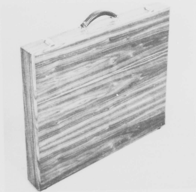
(a) Finished Display Kit