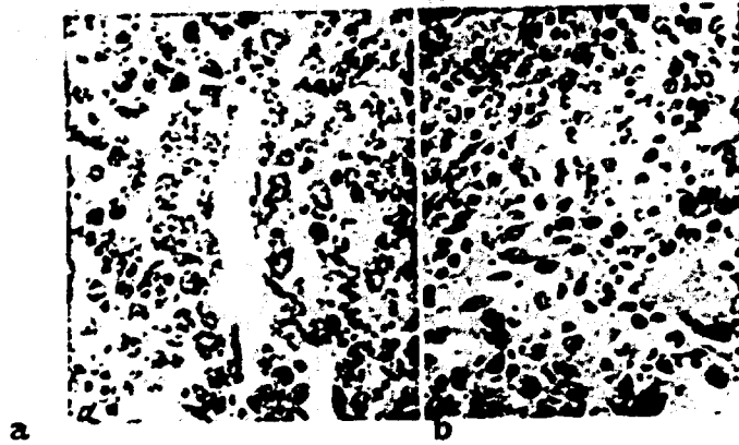
Figure 2. a -- spleen of a nonimmune guinea pig after 6 days following infection with 10 microbial cells; necrosis of the granulomas; adventitial elements of the vessel, located in the necrotic focus, were preserved; b -- subcutaneous cellular material of an immune guinea pig, infected with 10 million microbial cells and sacrificed on the 15th day; granulomas.