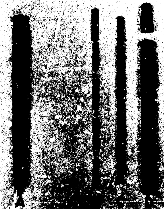
FIGURE 3. Automatic Pencil Made from a Laboratory Ink Marking Pencil. (A) Assembled and ready for use. (B) Piece of indelible lead separated by No. 7 shot and weighted from above by a metal plug. (C) Metal sleeve to hold lead, shot, and weight. (D) Plastic exterior case of pencil.