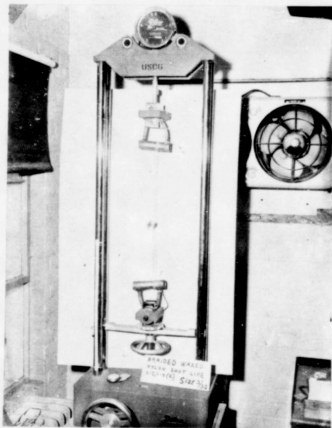
FIGURE 2 SAMPLE IN TENSILE TESTER