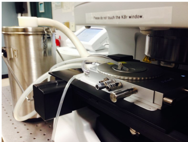
Figure 2. Image of the Linkam stage for measurements at cryogenic temperatures.