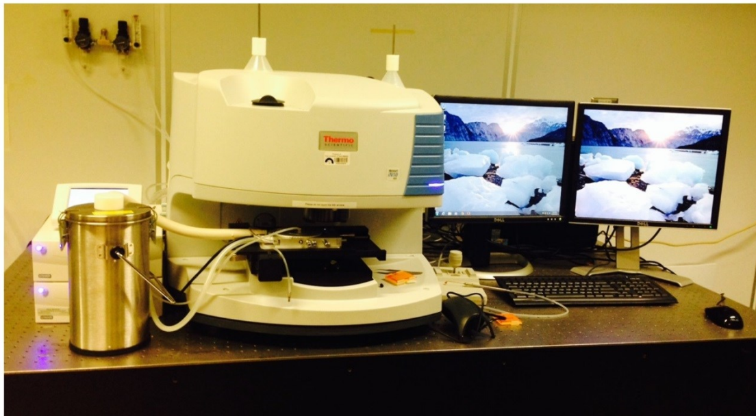
Figure 1. Image of the iN10 FTIR Microscope installed in the PI's lab

The iN10 FTIR Microscope is delivered and installed in the PI's lab. As shown in Figure 1, the unit has been installed on a newly procured vibration-free optical bench. Also a cryo-measurement attachment set-up called Linkam stage is acquired and is ready to be used shown in Figure 2.