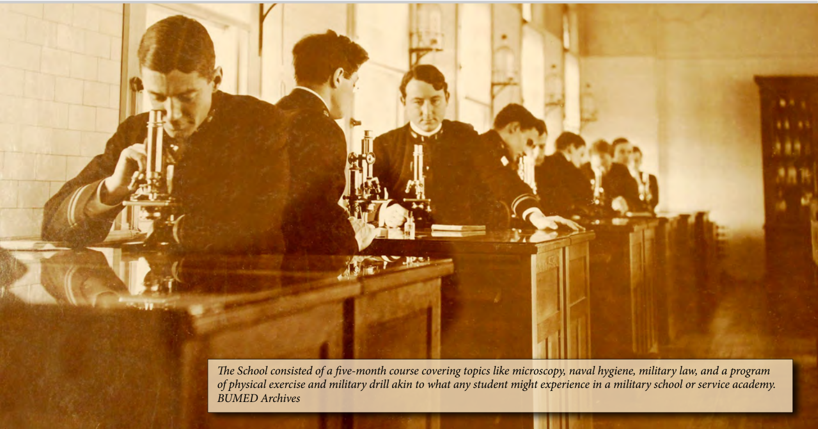
The School consisted of a five-month course covering topics like microscopy, naval hygiene, military law, and a program of physical exercise and military drill akin to what any student might experience in a military school or service academy.