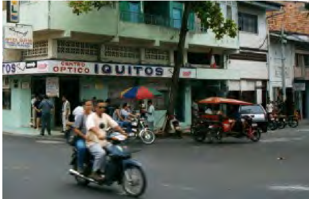
The City of Iquitos, Peru.

Subject-matter-experts from NAMRU-6 and nearly a dozen academic institutions, will carry out this work exclusively in the Peruvian city of Iquitos, where UC-Davis and NAMRU-6 have been conducting dengue disease surveillance for two decades.