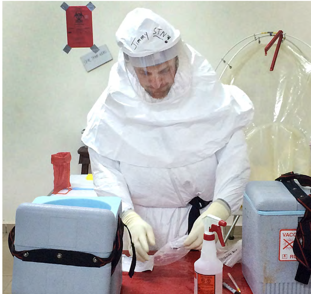
U.S. Navy Lt. James Regeimbal decontaminates and inspects sample documentation received at a Naval Medical Research Center mobile laboratories in Liberia, Oct. 7, 2014.

You have never seen joy until you have seen it on the face of an Ebola survivor. News of the Bong lab quickly spread to other ETUs, hospitals and safe burial