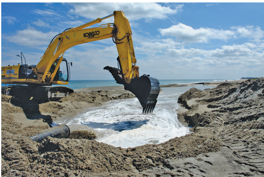
Figure 3. St. Lucie Inlet dredging beach discharge slurry, February 2014.