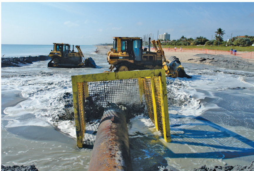
Figure 2. Offshore borrow material placed on Delray Beach, Florida, February 2014.