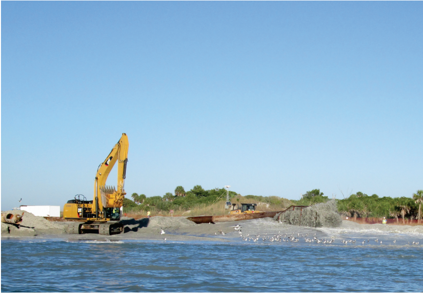
Figure 5. Egmont Key placement of dredged material from Tampa Harbor, December 2014.