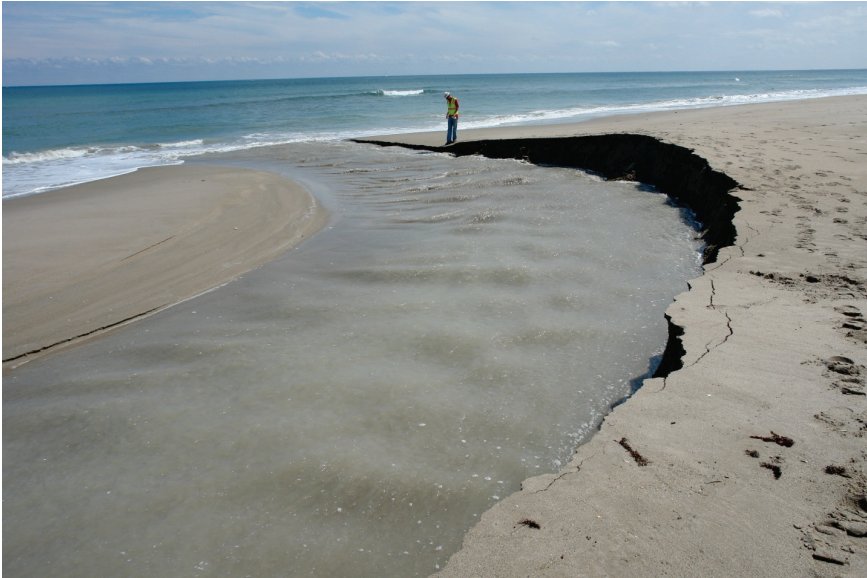
Figure 4. St. Lucie Inlet dredging return water flowing into the swash zone transporting fine sediments, February 2014.