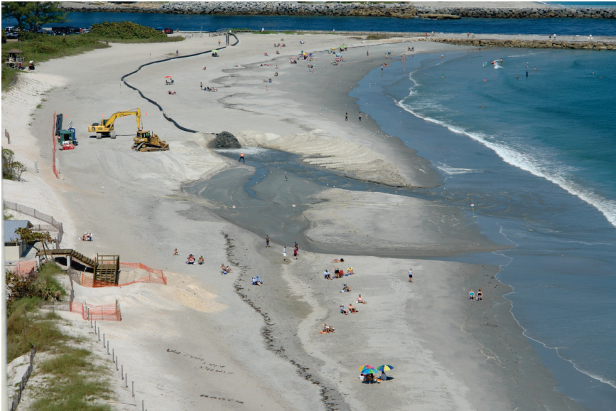
Figure 1. Sample collection of discharge slurry at Jupiter Inlet, Florida, February 2014.

To date intensive physical sampling of discharge operations have been conducted at Jupiter Inlet, Delray Beach, St Lucie Inlet, and Egmont Key, Florida.