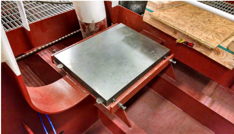
Mounting plate for MRU