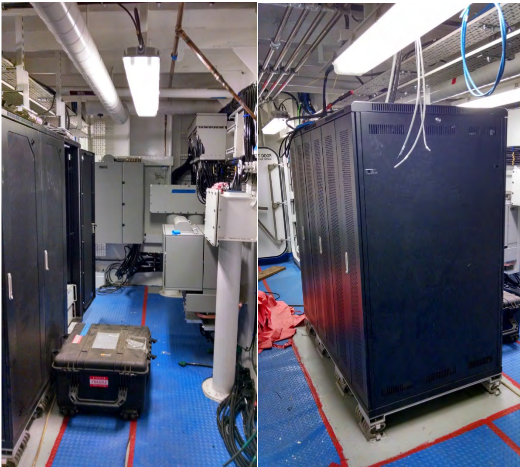
Upper Transducer Room