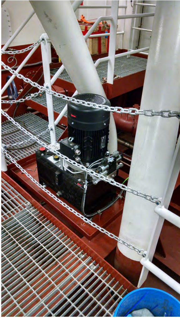
Hydraulic Power pack for Hipap