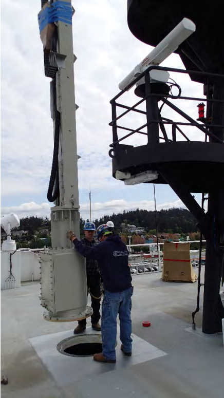
Figure 3 HiPap Install 28 April