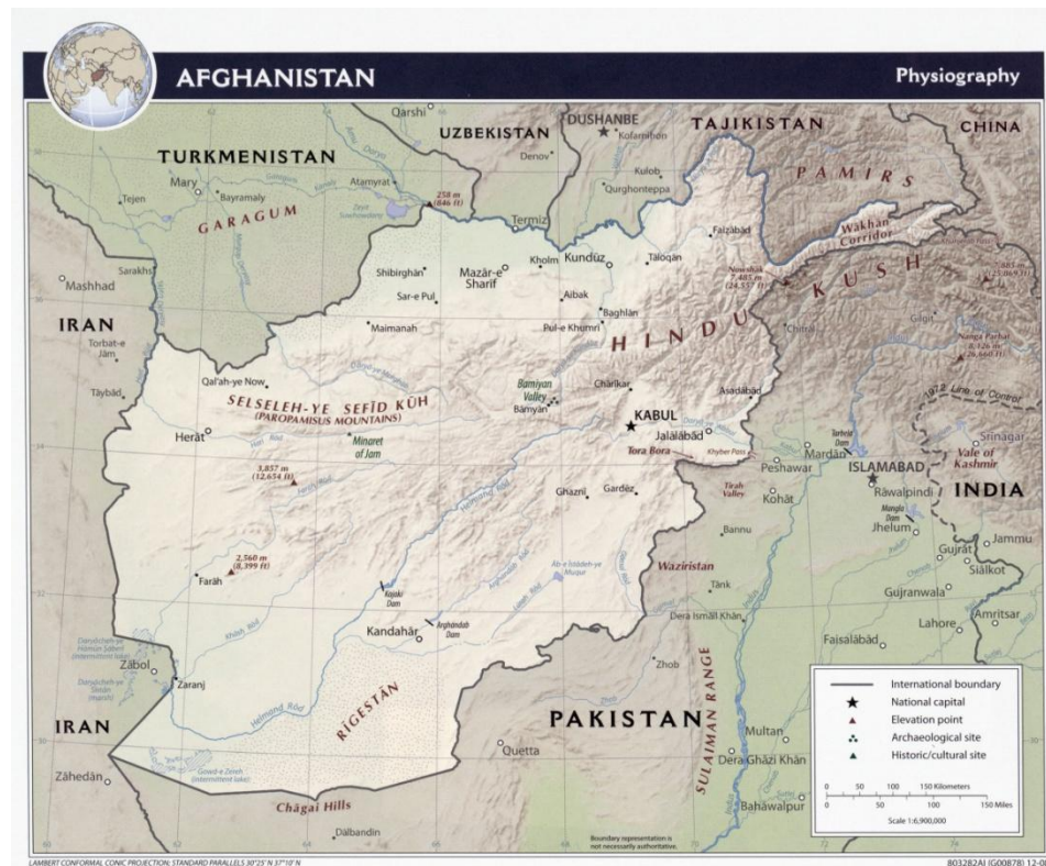
Figure 1: Relief Map of Afghanistan 1

The geography of Afghanistan plays an important role in the history and future of the country. As Figure 1 illustrates, Afghanistan is located in Central Asia—north and west of Pakistan, east of Iran, and south of Turkmenistan, Uzbekistan, and Tajikistan. The narrow Wakhan Corridor extends from the northeastern part of Afghanistan to meet the western part of China.