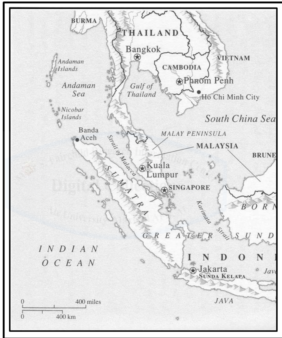
Figure 2: Map of the Strait of Malacca

These figures demonstrate the importance of this strategic location not only to the United States, but also to the world.