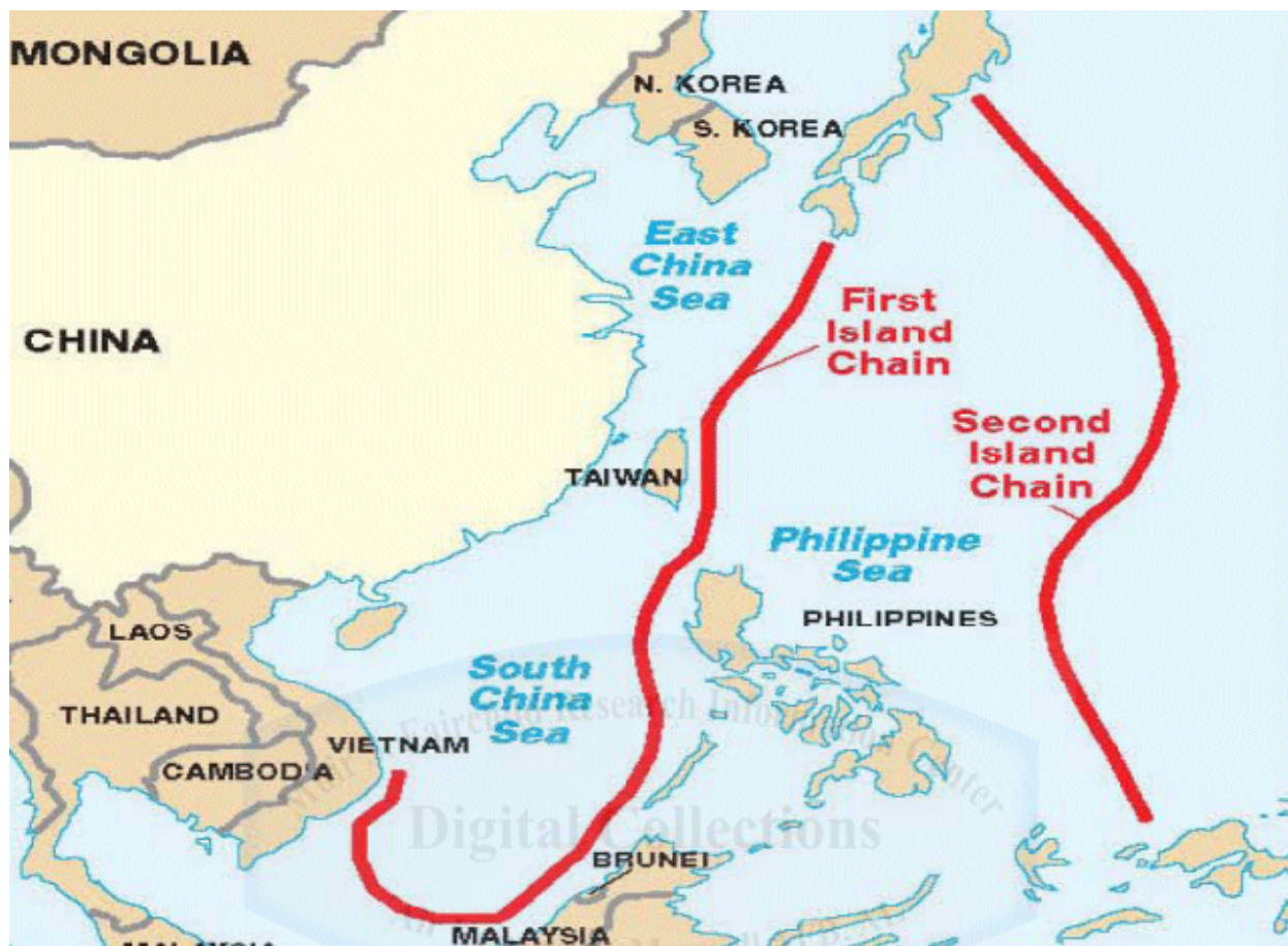
Figure 2: China's "Second Island Chain" stretching from Japan to Guam 4