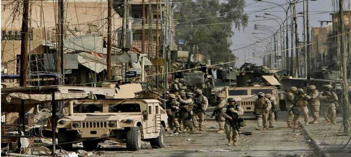
Illustration 4: Insurgency erupts summer of 2003