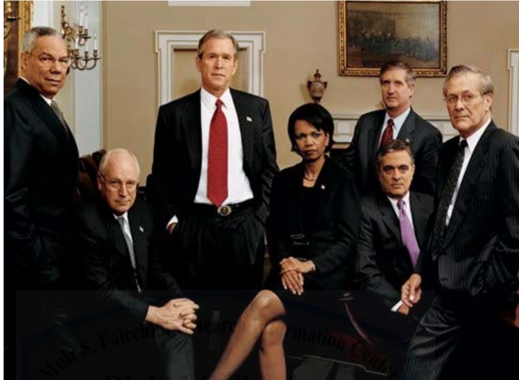
Figure 1: George W. Bush administration 2003

president in 2000, the Republicans had a chance to reshape American foreign policy. 3