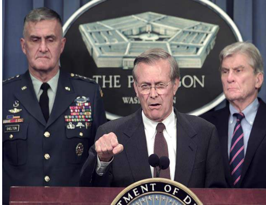
Figure 2: Defense Secretary Donald Rumsfeld 2003

http://burka.blogspot.com/RumsfeldAngry.jpg