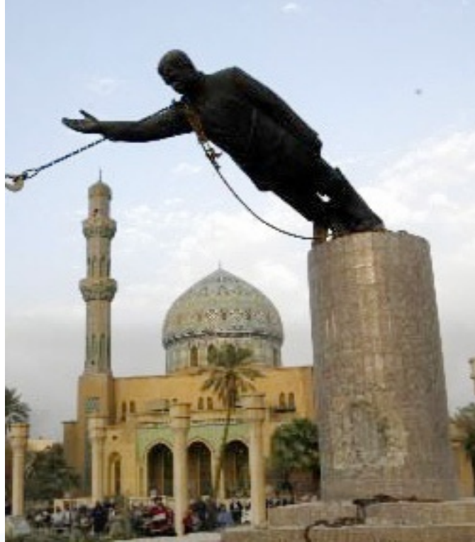
Figure 3: Fall of Saddam statue

https://upload.wikimedia.org/wikipedia/commons/thumb/c/c1/SaddamStatue.jpg/220px-SaddamStatue.jpg