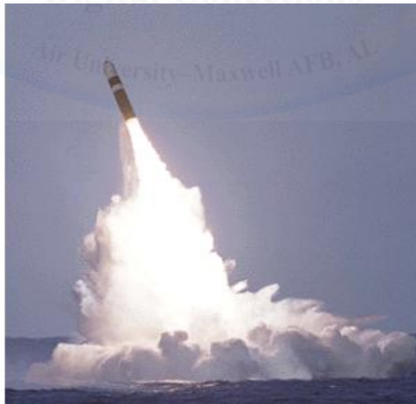
Figure 1. Launch of a Trident II SLBM 27

The Conventional Trident Missile (CTM) program endeavored to deploy modified Trident II submarine launched ballistic missiles (SLBM) aboard patrolling nuclear deterrent submarines. Each submarine would carry two conventionally armed missile modified to attain a 10 meter class accuracy at impact, in addition to twenty two nuclear armed versions. 24 The minimal modification required to field this system increased the likelihood of an earlier deployment, giving the President a new strategic option without resorting to nuclear weapons. 25 One variant would carry modified Mark IV reentry vehicles, designed to destroy targets by kinetic impact. This variant would reduce the likelihood of collateral damage, as it would not carry any explosive components. The second variant utilized a more conventional warhead, with high explosives propelling tungsten rods towards a target complex, potentially destroying targets within a 3000 square foot area. 26