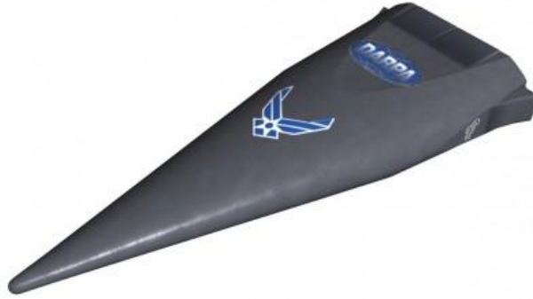
Figure 3: Potential Warhead External Configuration 37

Another requirement to prevent an accidental nuclear exchange is the mandate to launch from a location not currently associated with operational nuclear delivery systems. The existing requirement to launch all non nuclear-alert missiles and space launch vehicles away from populated areas makes the desired location coastal, ideally using existing launch facilities at either Vandenberg or Patrick AFB. The current plan as indicated in the CSM Enabling Concept utilizes the TP-01 launch facility at Vandenberg AFB in California. 38