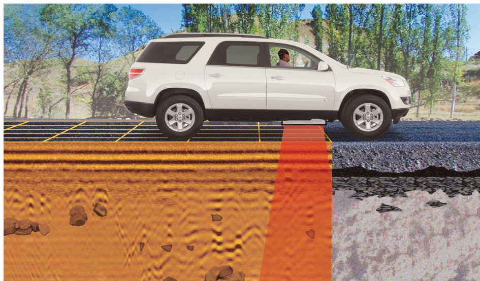
Localizing Ground-Penetrating Radar (LGPR) uses relatively stable subsurface features and their geolocation to locate the vehicle even in adverse weather conditions.

MIT Lincoln Laboratory has developed a sensor that provides real-time estimates of a vehicle's position even in challenging weather and road conditions. The Localizing Ground-Penetrating Radar (LGPR) uses very high frequency (VHF) radar reflections of underground features to generate baseline maps and then matches current GPR reflections to the baseline maps to predict a vehicle's location. The LGPR uses relatively deep subsurface features as points of reference because they are inherently stable and less susceptible to erosion or damage over time. It utilizes VHF radio waves because they can penetrate rain, fog, dust, and snow.