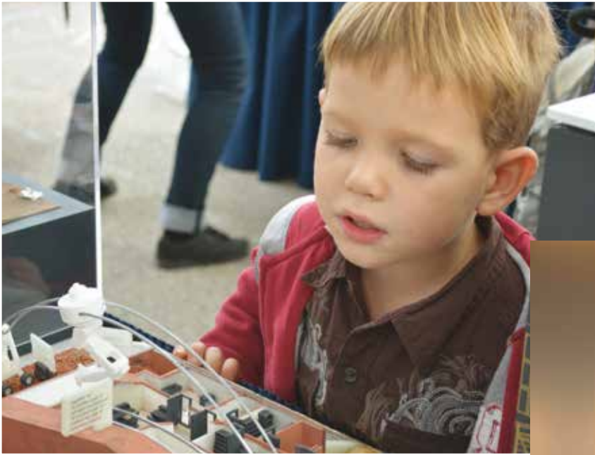
Left: A possible future engineer studies a model of an envisioned Mars-based habit as it is constructed by a 3D printer.