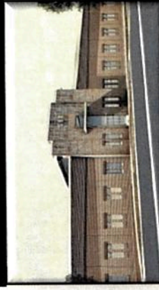
Tri-Service Research Laboratory NAMRU/SA, 711 th HPW