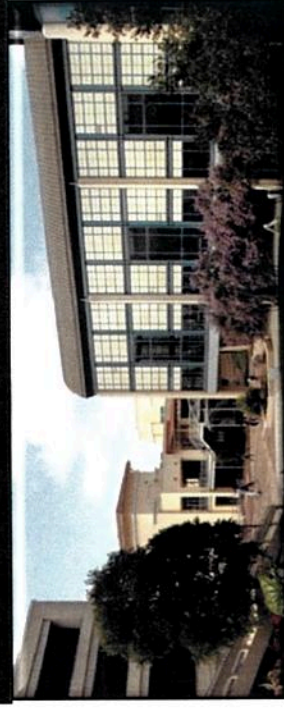
UT San Antonio