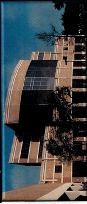
UT Health Science Center San Antonio