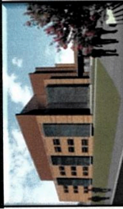
Battlefield Health & Trauma Research Institute