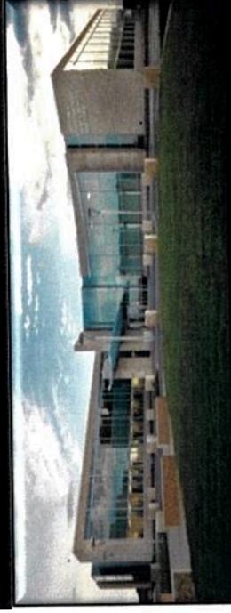
AF Post-Graduate Dental School & Clinic