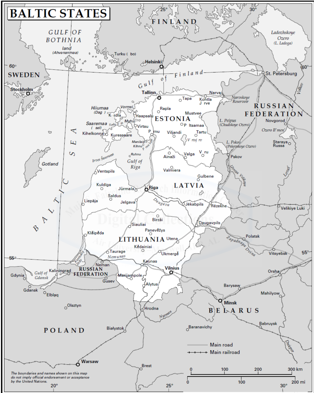
Figure 1. Department of Public Information Cartographic Section, Map No. 3876, United Nations February 1995