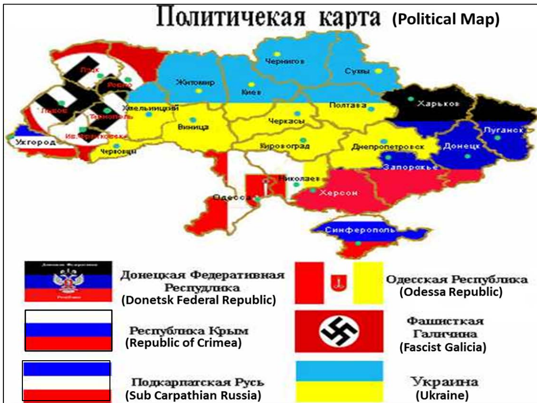
Figure 2. 2016 Russian propaganda map reflecting desired perceptions of Ukraine for a pro-Russian target audience. Note the “Novorossiya” flag encompassing Donetsk /Luhansk, the Russian flag over Crimea, and the Nazi flag over Western Ukraine. Geographic placement of flags aligns with demographic differences discussed in previous sections. Translation done by author.

Figure 2 (below) shows how a Russian vulnerability assessment can result in an information product made to exploit nationalist discourse to promote separatism.