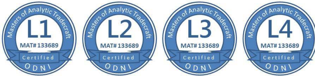
Figure 2. Proposed MAT Rating Badges (as conceptualized by the author)

Evaluations and MAT certifications of analytical rigor will be a unique capability of certified MAT analysts. Only certified MAT analysts will be empowered to evaluate and certify intelligence products. The following analysis will determine if an AIS sponsored schoolhouse, certified MAT analysts, certified intelligence products would or would not increase adherence to ICD 203 standards and improve the culture of analytical rigor across IC.