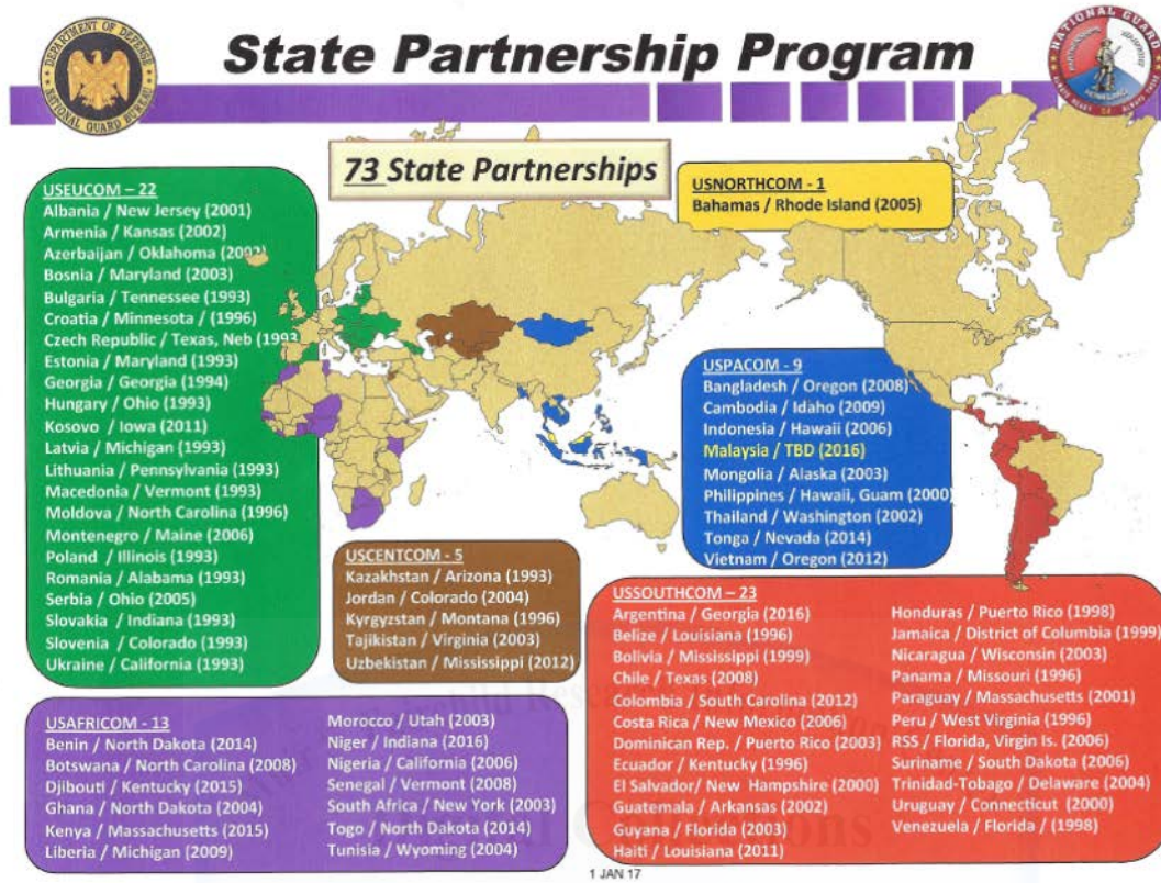
Figure 2: Current Established Partnerships 42