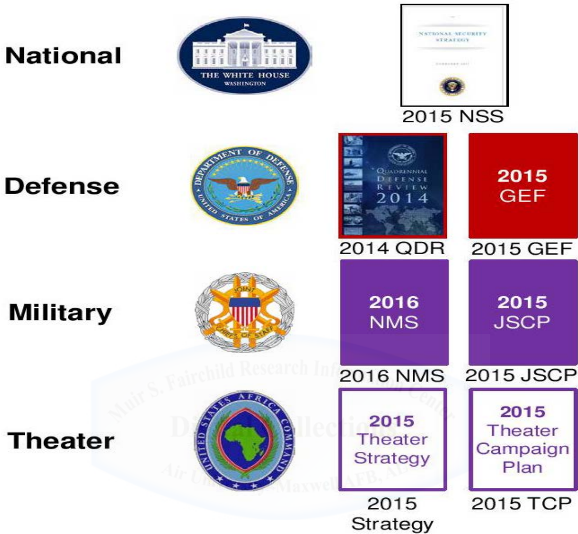
Figure 1 10 AFRICOM example of the strategic guidance hierarchy