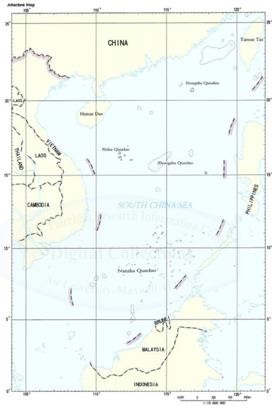
Figure 2: China's Nine Dashed Line Map 138