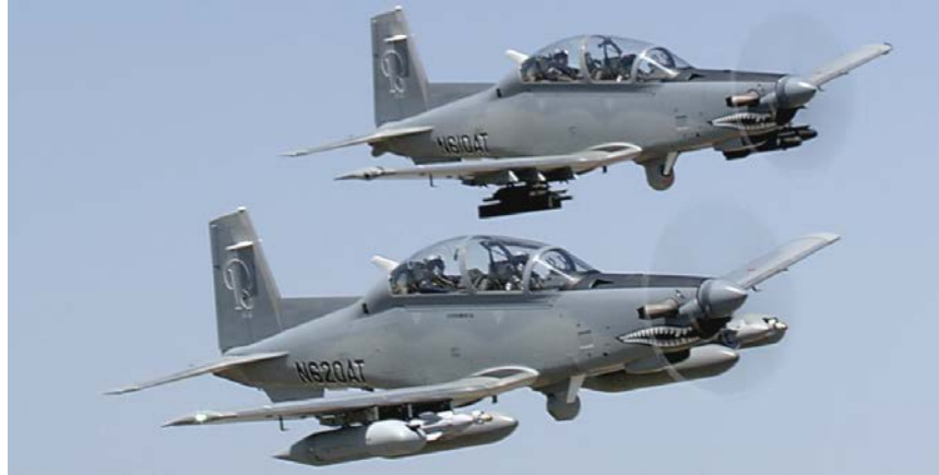
Picture 4: A pair of AT-6Cs with the flight lead armed with external fuel tanks, five hundred pound laser guided bombs and guns pods, and the wingman carrying Hellfire missiles and laser guided rockets.

Some authors argue that a light jet is better suited to fill the light attack role for the USAF, but this would be a mistake. Turboprop aircraft hold the advantage in fuel efficiency, survivability, maintenance requirements, and foreign object damage. These advantages negate the 100-150 mph speed advantage of light jets over turbo props. In his article “Stop Disrespecting the Turboprop,” Michael Pietrucha makes these arguments clearly. First, below 460 miles per hour, turboprops are more efficient than jets. Pietrucha notes, “an F-15E pilot could taxi on the ground for 6 to 8 minutes and burn the same amount of gas one of our proposed aircraft would use up during an hour of flight time.” 45 This lower fuel consumption not only means a more efficient cost per hour for a turboprop aircraft, but also decreased logistical requirement at operating airfields, allowing aircraft to be dispersed and based further forward.