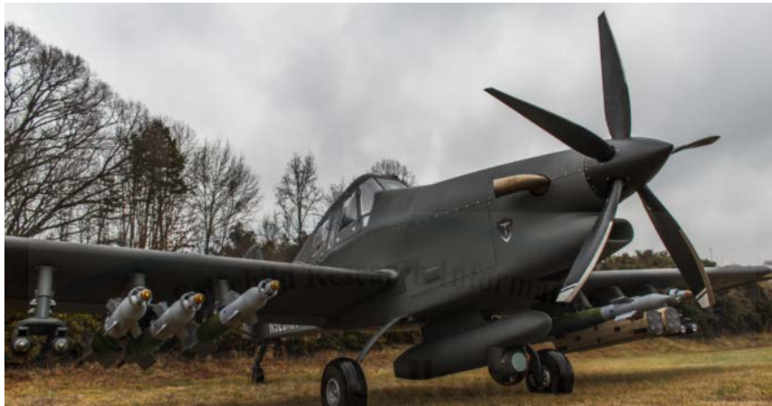
Picture 1: AT-082U Air Tractor pictured with 500-pound laser guided bombs, Hellfire missiles, laser guided rockets. (IOMAX)

heavily modified for the light attack mission. Equipped with a full complement of modern avionics and sensors, the Air Tractor can carry 8,000 pounds of ordnance on 15 hard points including 500-pound class smart bombs, rockets, AGM-114 Hellfire and .50 caliber machine guns making it the most heavily armed of all four aircraft. Cruising at 180 knots it can travel 1300 nautical miles (NM) remaining airborne for just over seven hours at a cost of approximately $400 per hour. 38