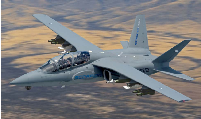
Picture 5: Textron Airland Scorpion with 500 pound laser guided bombs and Hellfire missiles.

could cost $370 million more per year to operate while providing less flexibility in maintenance and forward basing, as noted by Pietrucha. 49