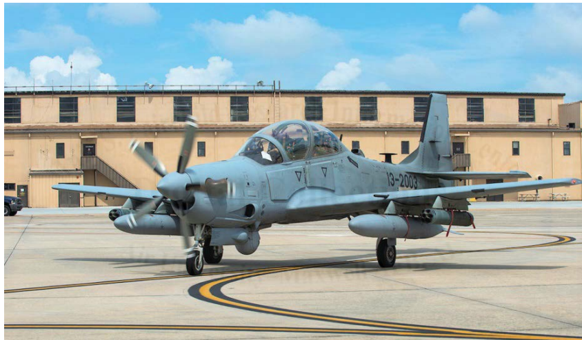
Picture 3: A-29B Taxiing at Moody AFB with auxiliary fuel tanks, rocket pods, and a sensor under the fuselage.

single engine attack aircraft with five hard points as well as fully modern avionics and smart weapons. However, as the Super Tucano is a Brazilian aircraft, US smart weapons are not seamlessly integrated as with the other two aircraft. It possesses no capability for the AGM-114 Hellfire. It carries 3,400 pounds, approximately half the payload of the Air Tractor or OV-10, but possesses better range and endurance. Cruising at 281 knots it can travel over 1,500 nautical miles and remain airborne over 8.5 hours at a cost of $500 per hour. Designed from the ground up as a combat aircraft, it has two internal .50 caliber machine guns and low-pressure tires to enable dirt field landings similar to the Air Tractor and OV-10.