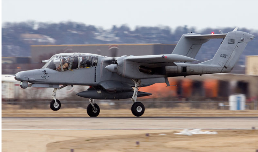
Picture 2: OV-10G+ Bronco pictured with an external fuel tank and integrated sensor under the nose.

Tractor its maximum payload is comparable. Modern versions of the OV-10 forwarded for consideration in the light attack mission are fully equipped with modern avionics and smart weapons.