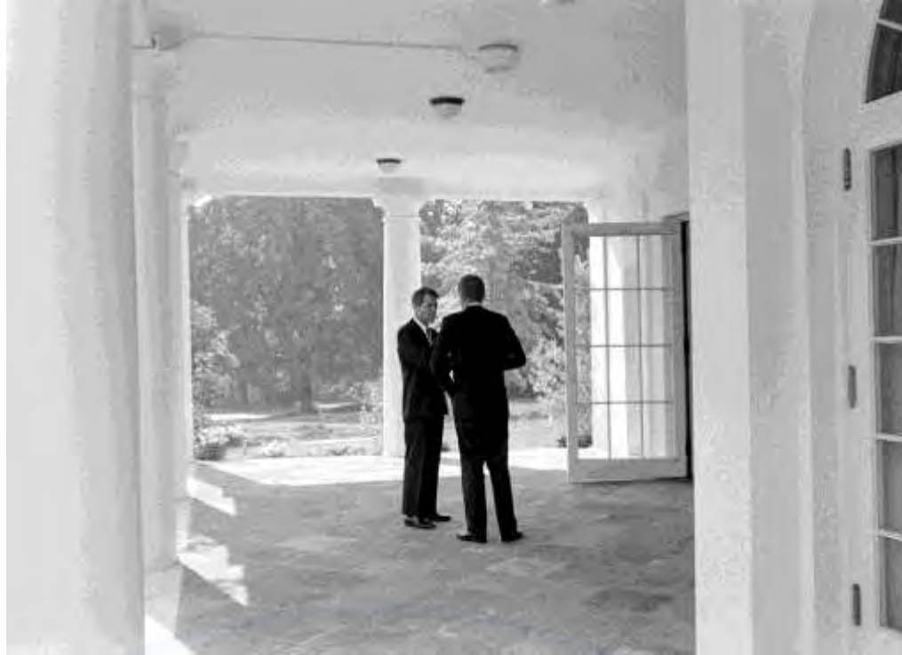
Figure 1. President Kennedy meeting with his Attorney General outside the White House in October 1962.

Robert Kennedy's place in his brother's cabinet and his increased role in international crises following the Bay of Pigs were essential to the handling of the Cuban Missile Crisis. While Bobby attempted to protect his brother from dissenting opinions late in the Bay of Pigs planning, he later realized these attempts had a negative effect and changed his role accordingly in the Cuban Missile Crisis. These precursors set the necessary conditions for the peaceful resolution of the 1962 crisis. The personalities involved in advising the President were in place, and had formed relationships with each other because of the lessons learned from the Bay of Pigs disaster. Among those individuals, the key personality of Robert Kennedy would prove the most valuable.