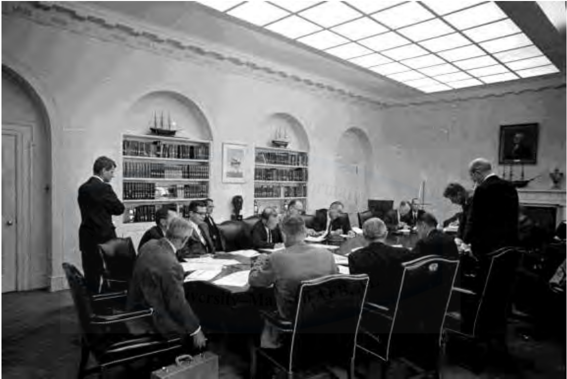
Figure 3. October 29 th, 1962 EXCOMM Meeting

critical tool during the crisis. Years later, Edwin Guthman describes Robert Kennedy's opinion on the strength of EXCOMM as "how well it had functioned, how close the members had become, how open and unpretentious their discussions had been," 138 and ultimately how successful they were.