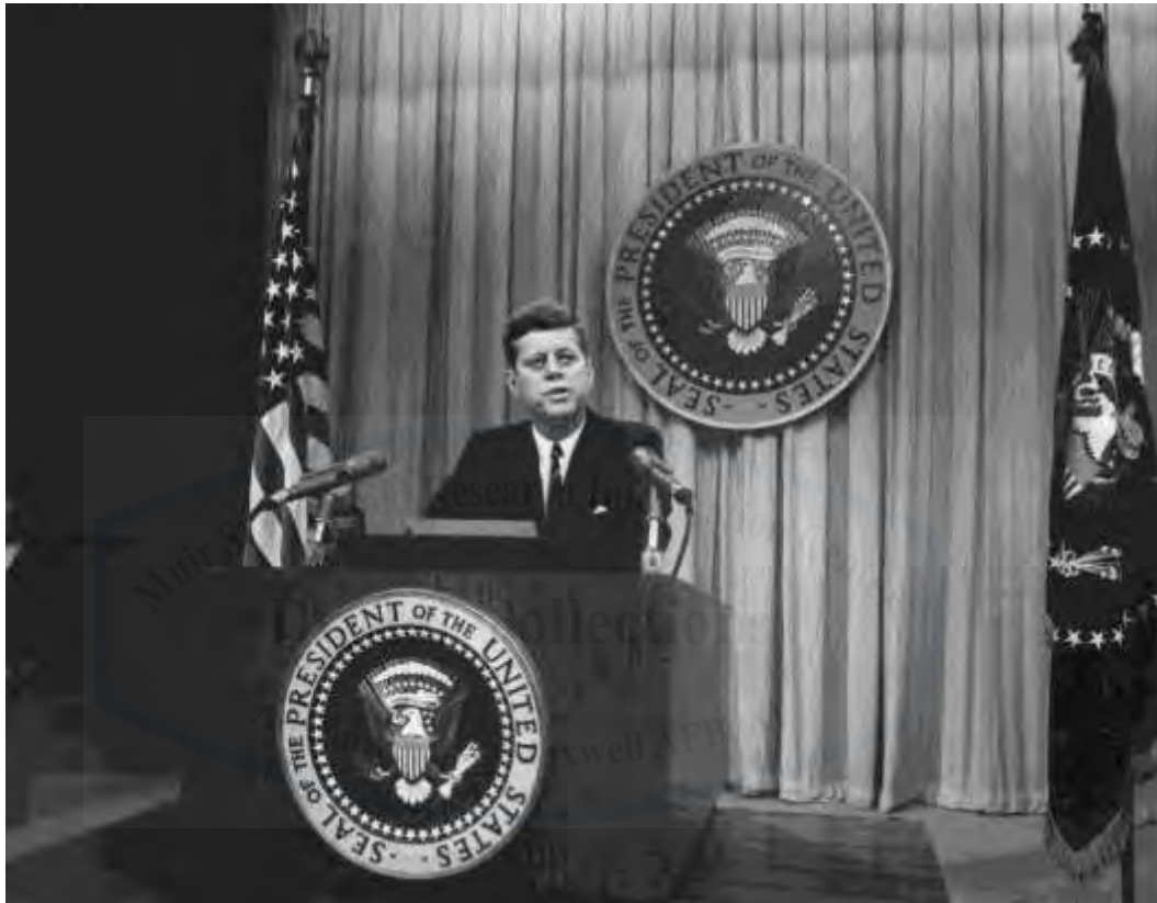
Figure 4. President Kennedy speaks at a press conference on November 20 th

assumed for you as President a certain significance and probably created certain difficulties. We grant it.” 32 Following the President's meeting with his Science Advisory Committee, his brother Bobby was waiting for him in order to personally deliver the good news.