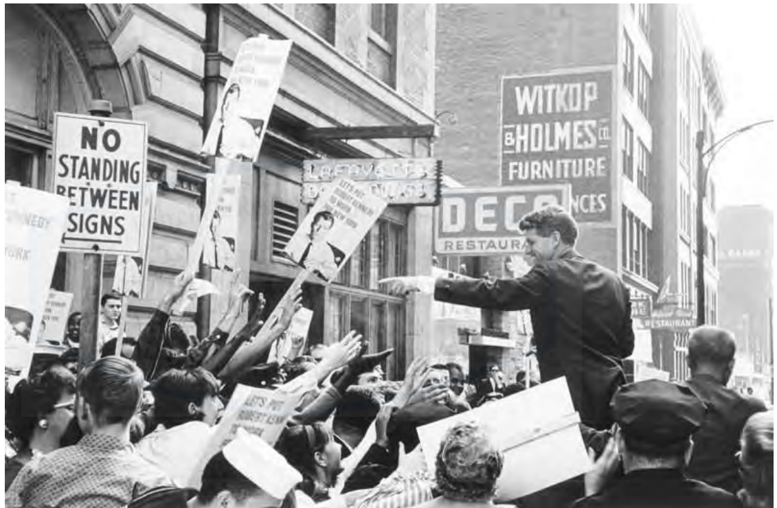
Figure 5. Robert Kennedy campaigning in New York

Late in 1964, the Politburo ousted Khrushchev from power. He became vulnerable following the Cuban crisis, seen by his rivals as an example of “harebrained scheming,” 14 and they began plotting his removal soon afterward. With Kennedy gone and a changing relationship with the United States, Khrushchev was easily removed from power and forced to retire far removed from the centers of power in Moscow. 15