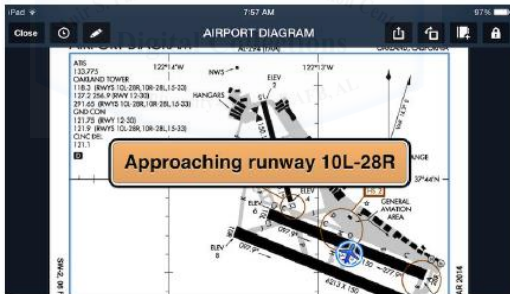
Figure 2 32 - ForeFlight Application on iPad featuring Airfield Diagram and aircraft overlay

The ForeFlight application receives information from a Stratus ADS-B receiver while in-flight. 30 The Stratus with ForeFlight gives GPS position. 31 This gives the aircrew the ability to see the aircraft on the charts, approach plates, and airfield diagrams. By being able to visualize where the aircraft is on the airfield, the route of flight, and the approach plate, the aircrew has better situational awareness in the decision making process that increases safety. An example of the benefits of this application to safety is when there is low visibility at an airfield. The taxiways and runways are shown with the position of the aircraft. Reference Figure 2 for a visual of the aircraft displayed on the Airfield Diagram at an airport. This helps the aircrew decipher where they are in relation to specific taxiways they need to turn onto and prevents them from accidentally entering a runway in low visibility.