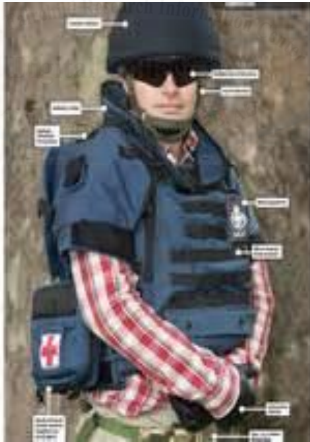
Figure 3. Deployed DOD Civilian

Health Assessments. Periodic health assessments must be current IAW service policy at the time of deployment. All DOD personnel traveling to the theater for more than 30 days will complete or confirm as current a pre-deployment health assessment within 60 days of the expected deployment date. 43 All personnel required to complete a pre-deployment health assessment will complete a post-deployment health assessment no earlier than 30 days before redeployment or no later than 30 days after redeployment. 44 A person-to-person mental health assessment , with a licensed mental health professional or trained and certified health care personnel within two months before deployment and in three time frames after deployment. 45