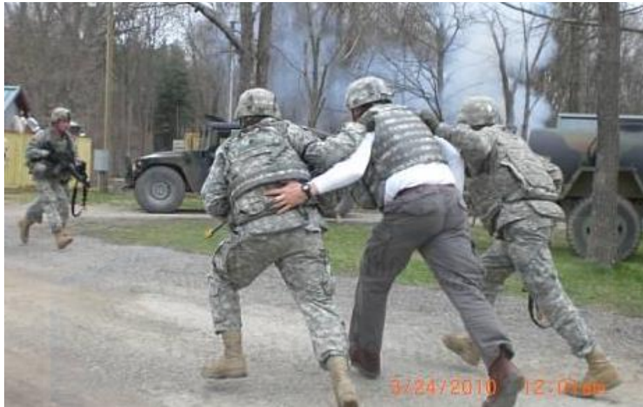
Figure 1. Civilian volunteers participating in required training exercises in preparation for deployment to theater. 2

With medical and physical standards readdressed for age and area specificity, the AF Surgeon General and Combatant Commands can request and fully utilize the AF civilians they desperately require for mission accomplishment. The Air Force cannot afford to lose the experience, knowledge, and expertise of our DAF civilian employees, in the AOR.