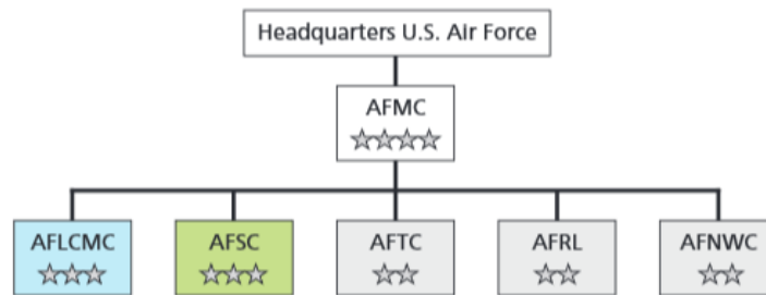
Figure 2: AFMC after reorganization (Tripp et al., 2012)

Additionally, in 2015, the Air Force Installation and Mission Support Center (AFIMSC) was added to AFMC as the headquarters for providing installation and mission support capabilities. This organization is now the enterprise manager for all installation support functions, but most importantly security forces, civil engineering, communications, medical, and logistics readiness (AFIMSC, 2017). This now brings most of the classes of supply into either the AFSC or the AFIMSC. This allows for a known manager for logistics processes in the Air Force and improves the Air Force Enterprise’s ability to present combat support capabilities to the combatant commanders and those deployed logisticians in the field.