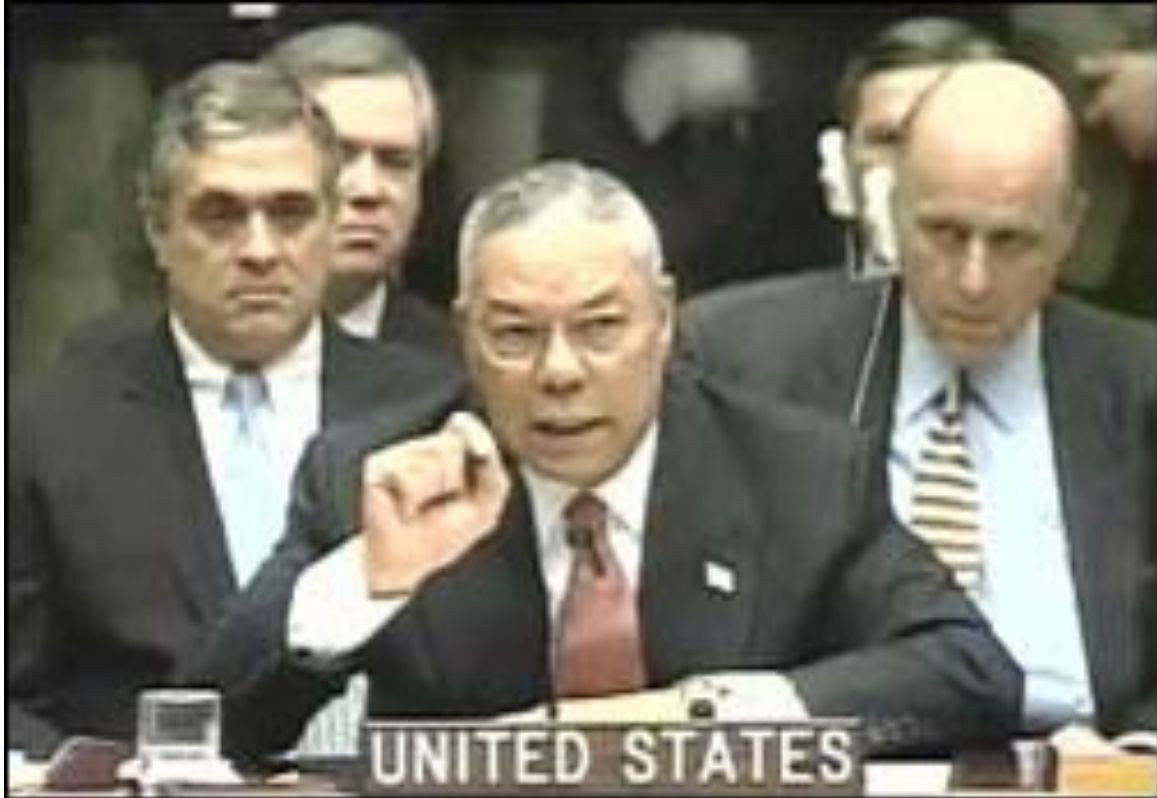
Figure 2. Director Tenet and Secretary of State Colin Powell Getting Too Close at the UN. 73