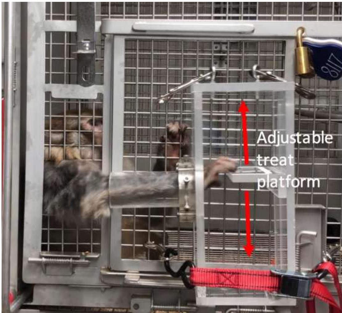
Figure 2: Actual device used for measurement of wrist extension angle.